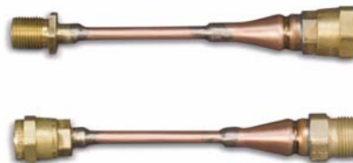
Self-Sealing Quick-Connect Adapter Kit

Self-sealing Quick-Connect Adapter Kits (P/N 755570000) are available for replacement cooling units or evaporators that join older "one-shot" units to their new self-sealing counterparts. Professional installation is required to capture and recharge the refrigerant.