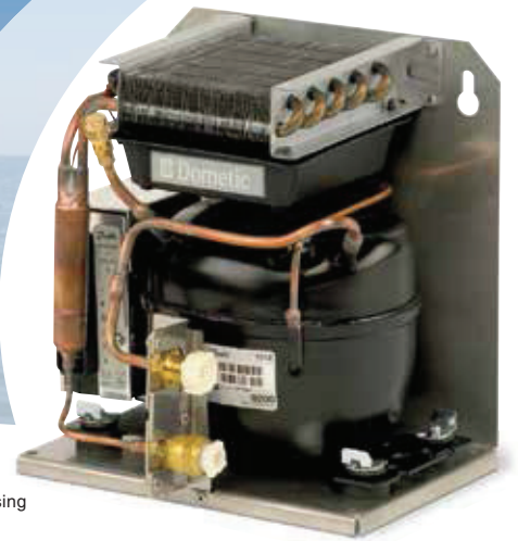
CU-86 condensing unit shown

Performance, efficiency, and quality are hallmarks of the CoolMatic 80 Series by Dometic. Compact, easy-to-install CoolMatic units are designed to provide up to 8.8 cu. ft. (249 liters) of refrigeration or up to 2.5 cu. ft. (65 liters) of deep freezing. Powered by a Secop BD35F compressor, the versatile CoolMatic Series offers three different configurations for installation flexibility and tailor-made cooling applications.