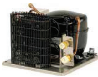
CU-55 condensing unit