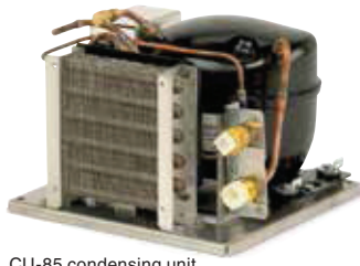
CU-85 condensing unit