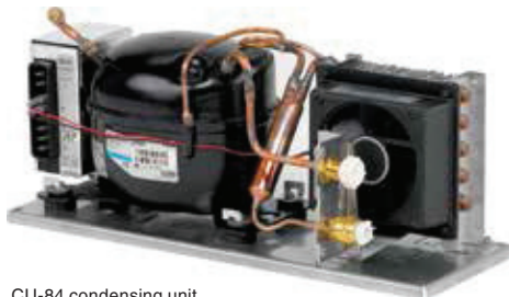
CU-84 condensing unit