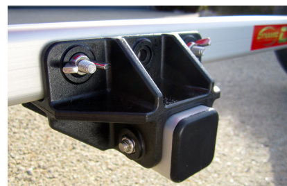
Wing Nuts for Quick Disconnect