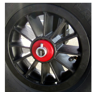
Snap Button Immobilized