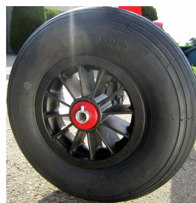
Unsecured Snap Button