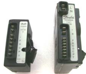
DC electronics module (left) AC/DC module (right)

It is important to test the power at the terminals on the electronics module. Bad wiring or connectors can keep power from reaching the electronics module.