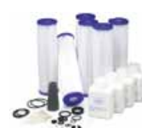
Extended Cruise Kit

Katadyn reserves the right to modify products