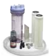
Silt Reduction Kit

For waters with high levels of suspended matter, e.g. in shallow anchorage, we would recommend you use an additional prefilter. This additional filter is finer (5 microns - 1 micron = 0.001 mm) than the standard filter (30 microns) and is placed after it. A booster water pump (12V/0.8 A/h) is also provided. This pump compensates for the loss through the second filter and increases water production. We would also recommend the prefilter kit when the PowerSurvivor is not installed under the water line and when it is in constant use to increase the intervals between servicing.