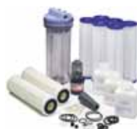
Preventative Maintenance Kit