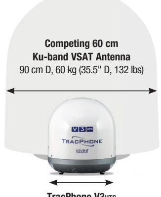
TracPhone V3HTS 39.4 cm D, 11.3 kg (15.5" D, 25 lbs)

Streamlined belowdecks unit includes: IP-enabled antenna control unit, built-in CommBox Ship/Shore Network Manager. high-throughput modem, Voice over IP adapter, and built-in Wi-Fi and Ethernet switch.