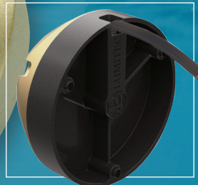
4" Dia. X 1.6" D