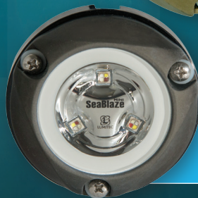
3" Dia. X 1.2" D

Lumens: 2000+ Output: Dual Color white/blue or RGBW Spectrum Voltage: 10-30vDC CCT: 6500K