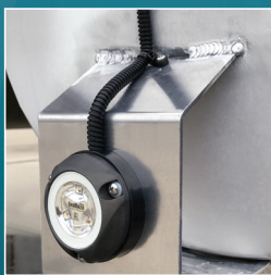
Mounts to a standard transducer/accessory bracket

Zambezi underwater light, like its namesake (Zambezi is an African bull shark) is tough, tenacious, and built to survive completely submerged in salt or fresh water. Zambezi's wire and seal are the result of more than 70,000 hours of ingress and long-term permeability testing. This completely sealed surface mount design allows lights to be applied to situations that require surface run wires. From pontoon boats to floating docks, the application possibilities are limitless for this versatile and durable surface mount underwater light.