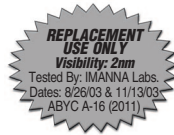
Fig. 0602 Series Sidelight Instructions

The above lights are for replacement use only on power driven vessels under 20 meters (65.6 ft.) in length, operating on a nominal 12 volt or 24 volt system. In order to comply with the '72 COLREGS and the U.S. Inland Rules, the following must be adhered to: