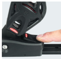
Ergonomic plunger stop operation