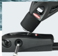
Removable lead block