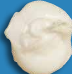
F6 MICROSPHERE FAIRING FILLER