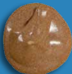
F5 LIGHT DENSITY FAIRING FILLER