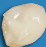
F2 STRUCTURAL ADHESIVE FILLER