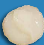
F3 LIGHT DENSITY ADHESIVE MICRO FIBER FILLER