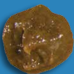
F4 BRIDGING ADHESIVE FILLER