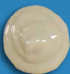
F1 HIGH LOAD ADHESIVE FIBER FILLER

★★★★★ = Best ★★★★★ = Better ★★★★★ = Good No Claw = Do Not Use