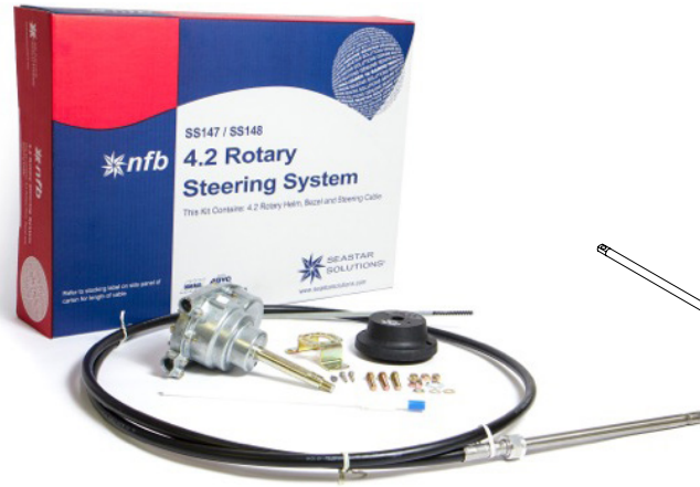
NFB™ 4.2 Single Cable System (Steering Wheel not included.)

Issue Date - Jan 2015 Issue Number - ms6