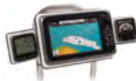
Two SP1BOX on a SPOD .

SP1BOX allows you to mount additional instruments to your SPOD or DPOD .