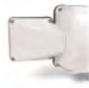
Back view of SP1BOX .