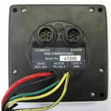
SP120 Display (Rear) Wiring Diagram