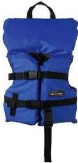
Type II Life Jackets