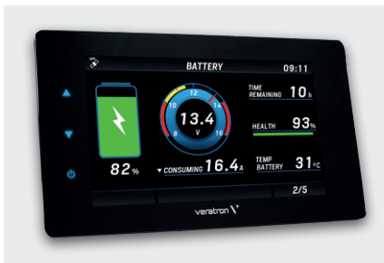
Intelligent Battery Sensor (IBS) screen to keep your energy supplies under control

The embedded NMEA 2000® gateway brings all the sensor readings and alarms to your external multifunctional display, saving the cost of an additional converter.