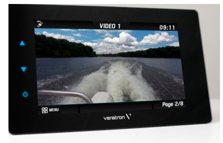
Every place of the boat is under your control thanks to the dual video input