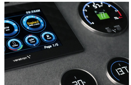
The VMH series look and feel gives an elegant and stylish touch to your dashboard