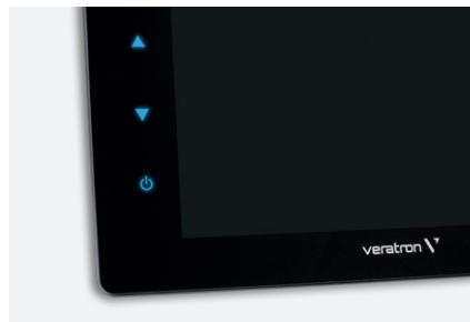
Lateral touch buttons are RGB illuminated and allow for a quick brightness adjustment