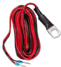
Temperature sensor for Quattro, MultiPlus and GX Device (such as the Cerbo GX)