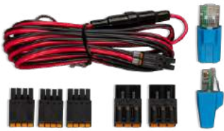
Accessories included with the Cerbo GX