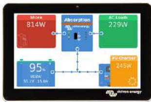
GX Touch (optional display for Cerbo GX and Cerbo-S GX)