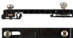
DIN35 adapter small DIN-Rail adapter to easily mount a device on a DIN-Rail. Suitable for the Cerbo GX.