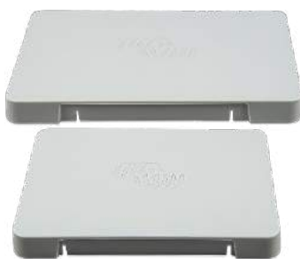
GX Touch 50 & 70 protective plastic cover (not for the Flush model)