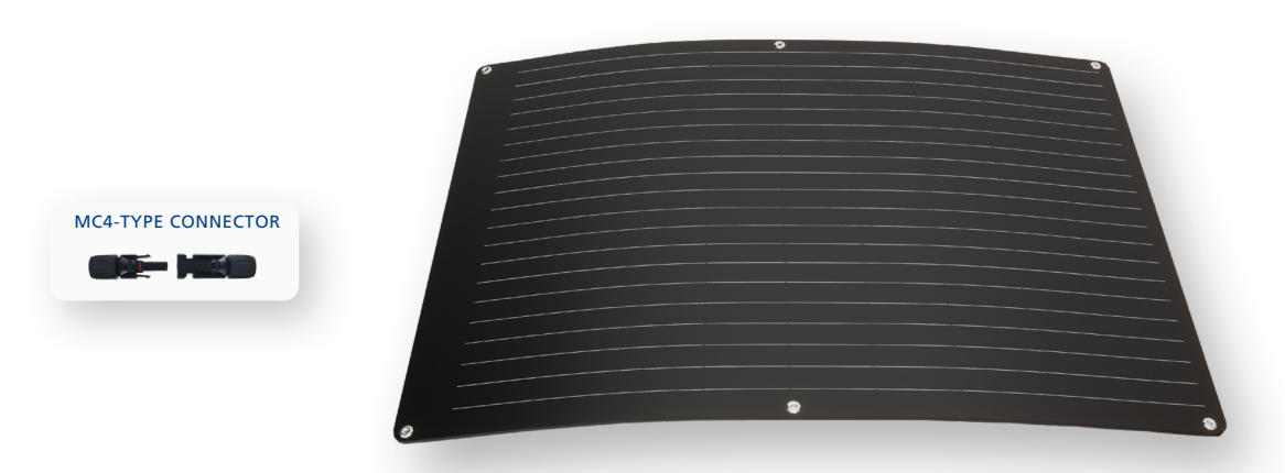
110W Xantrex Solar Flex Panel